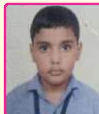
Ayyanar Std. VII (82%) (DTEA)