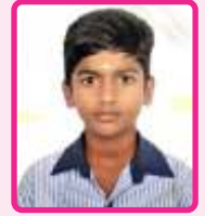
Tamlarasan Std. IV (76%) (DTEA)