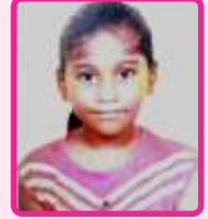
Charunethra Std. V (70.40%) (DTEA)