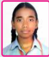
Sanskruti Std. VII (68%) (SNPS)