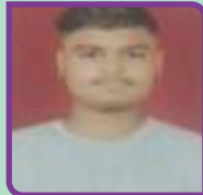
Bhavishya Sagar (SPV) 76.6%