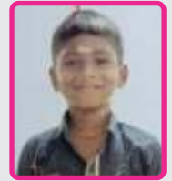
Vetrimaran Std. III (66%) (DTEA)