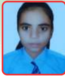
Sweety (Govt. School) 61%