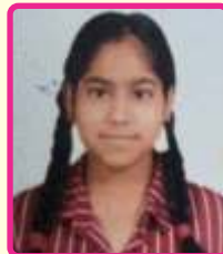
Gungun Std. VIII (86%) (SNPS)