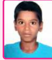
Shivagiri Std. VI (71%) (DTEA)