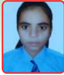
Sweety (Govt. School) 61%