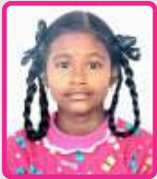
Priyadarshini Std. VII (66%) (DTEA)