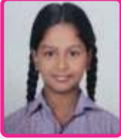
Hema Std. VII (75%) (RKSNS)